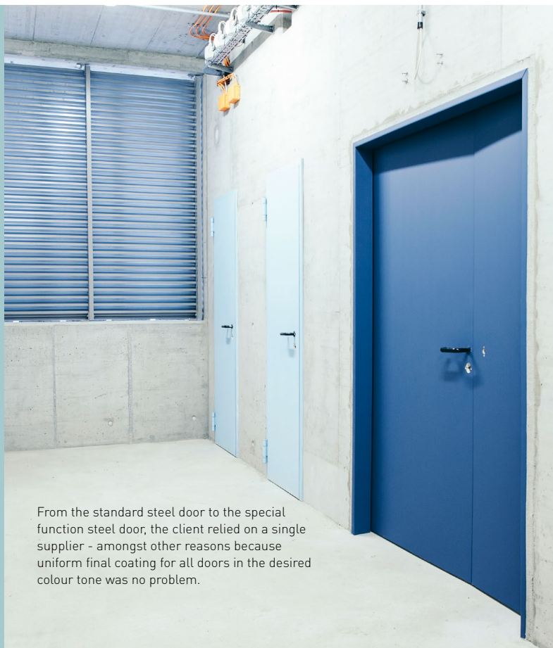
From the standard steel door to the special function steel door, the client relied on a single supplier - amongst other reasons because uniform final coating for all doors in the desired colour tone was no problem.

It is particularly important for such large-scale projects that construction product manufacturers work closely with with the executing companies. Teckentrup demonstrates with tailor-made, customer-oriented services and sophisticated construction elements how such a partnership can be fulfilled in a modern way. The Niederfinow ship's hoist therefore is a blueprint for how the Teckentrup credo „Always the best solution - your solution“ can be implemented.