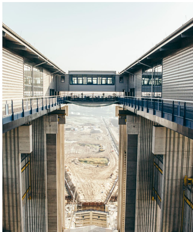
One of the largest infrastructure projects for shipping is about to be launched: The new ship hoist is in Niederfinow/ Brandenburg.