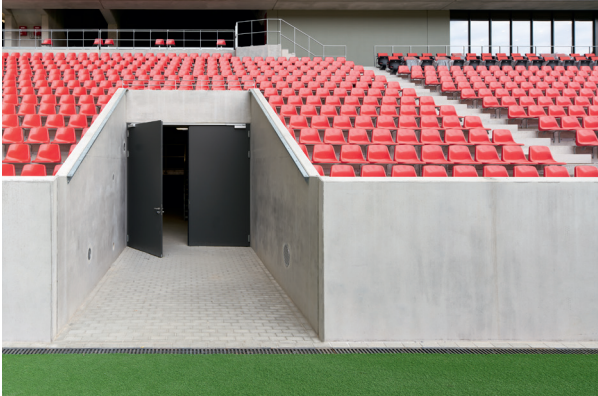
Hinged doors with the dimensions of an industrial door also leave room for large equipment and serve as an escape route at the same time.

Teckentrup supplied over 250 doors with a wide range of requirements for the stadium project. In the technical area, for example, large doors were required as a passage for large equipment and vehicles. In addition, the EI230 doors are equipped with burglary protection (RC2/RC3) and full panic function as well as provision for SALTO fitting or Magic Eye fitting, depending on the place of use.