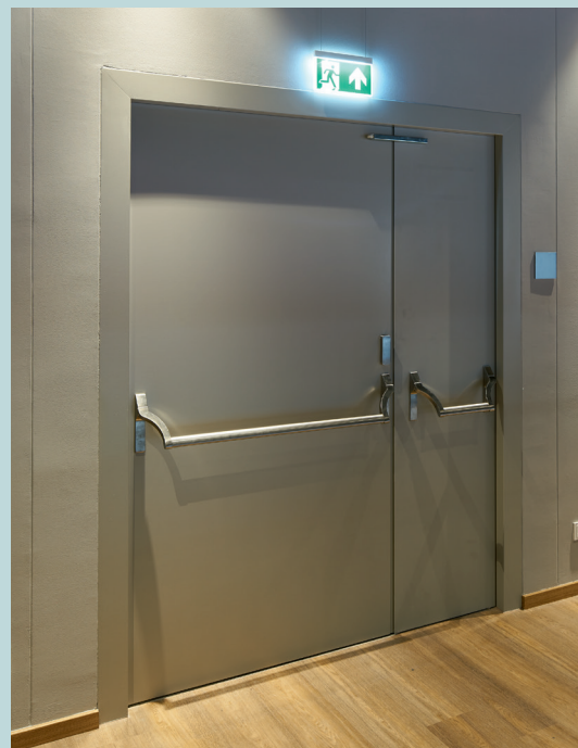
Doors along escape routes must always be operable, even if the doors are locked. Panic bar handles offer a safe solution here, as they automatically unlock when physical pressure is applied to the door element.