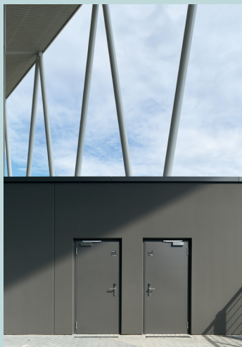
Usage for the EI 2 30-C5-SA „TECKENTRUP 62“: Right from the start accessibility was also on the agenda for the fire doors in the outside area.