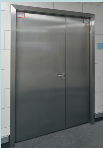
Enhanced hygiene requirements: Stainless steel doors are used in the kitchen and catering areas. The simple surface design also allows for modern aesthetic interior design.

Making it easier for people with disabilities to visit the stadium is a key concern for SC Freiburg and was therefore taken into account from the very beginning when planning the new stadium. Barrier-free access via ramps, threshold-free and automatically opening doors as well as suitable wheelchair spaces were planned from the outset.