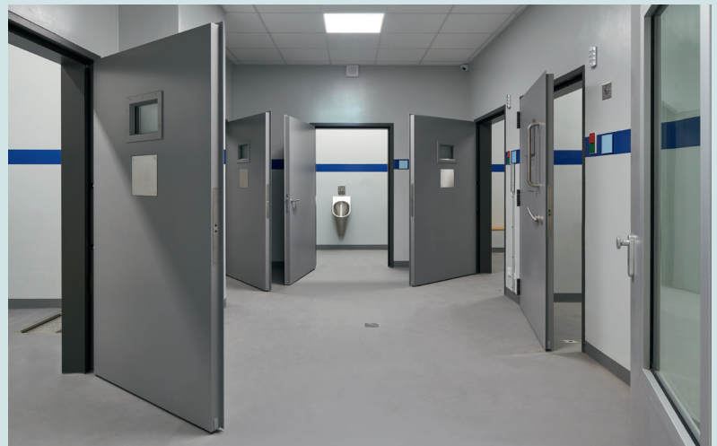
Unfortunately, anyone who spends their stadium visit behind one of these doors misses out on the game. The flush installation prevents injuries on both sides. Glazed cut-outs with privacy seals serve to observe the occupant if necessary.