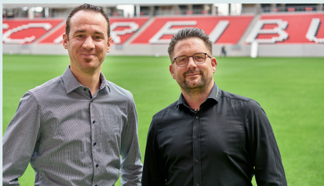
Regionally rooted: In the southwest, Teckentrup and Schwarzwald Elemente have been working together successfully in the field of building elements for years.