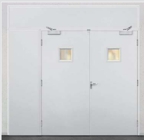
Optional floor seal

In addition to their outstanding features, the new fire protection doors "Teckentrup HC"-BS are also characterized by their stylish appearance. The flush-edge door leaf sits perfectly in the frame and forms a flat surface with the wall. Numerous detail solutions, glazing elements, side parts and upper casings enable attractive concepts that expand the design spectrum.