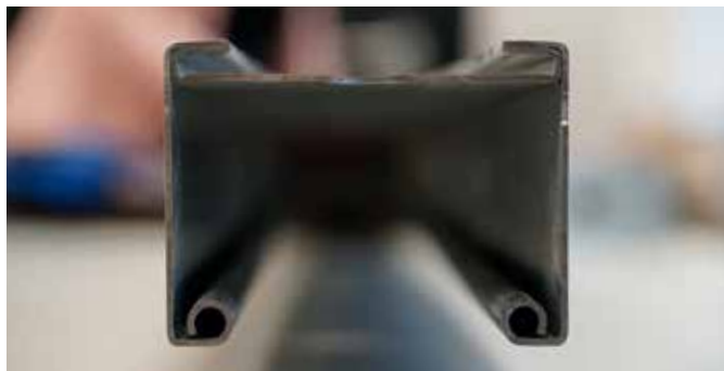
New tubular system

To ensure that our fire protection sliding doors do not only meet the highest safety requirements and design demands, but also meet the new European directives, we optimised our products accordingly. The fire protection sliding doors are equipped with a completely new tubular system, that conceals door technology (including