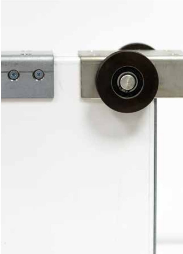
Door leaf in EI 2 30 version

No matter which fire protection sliding door you need: Our range offers solutions for all eventualities. You always benefit from first-class materials, precise workmanship, a long service life - and now, of course also from safety standards that are recognised throughout Europe.