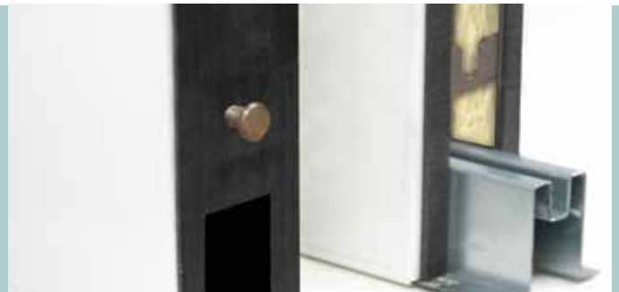
Mushroom pull knob system