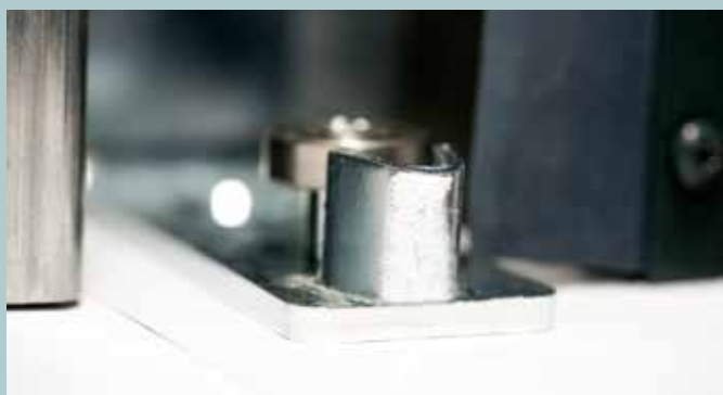
Illustration/view of lower guide

The new lower guide rail enables concealed mounting of the guide roller so that the door leaf guide is not visible. Since the guide roller is screwed to the counter feed, the position is predetermined, which prevents possible assembly errors. Further, there is no screw connection into the floor required.