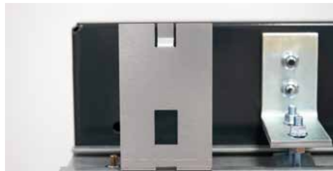
Suspension/feed for fascia panel

fastening elements and locking system) entirely behind the fascia panels. Thanks to this new system, the doors are not only particularly easy to install and maintain, but also score with an attractive appearance.