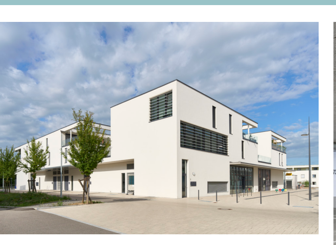
The new Riedpark in Lauchringen is a mix of living, shopping, parking and working. Many steel and industrial sliding doors are part of this complex, which also have to meet different requirements depending on the different uses.