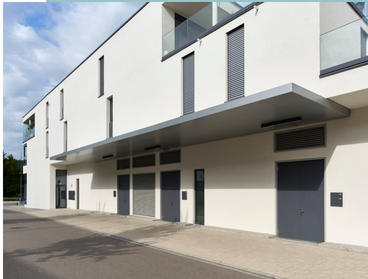
External steel doors to the commercial units. The robust steel elements blend in visually with the overall appearance of the complex and protect against break-ins with security class RC3.

Teckentrup GmbH & Co. KG Industriestrasse 50 33415 Verl-Sürenheide Phone 05246 | 504-0 E-Mail info@teckentrup.biz