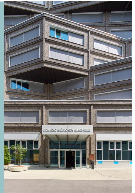
The staggered floors of the Scandic Hotel – part of the new “Macherei” quarter in Munich – create unusual visual axes. At the same time, roof terraces are created that look like private retreats.

The southernmost Scandic hotel in Germany offers 234 rooms on nine floors. From the outside, the building impresses with its intricate architecture – here, it is possible to create private zones with a connection to the outside in a small space. Smartly designed areas create a living room atmosphere in the spacious reception area – with bookshelves, games tables and two meeting studios for small meetings.