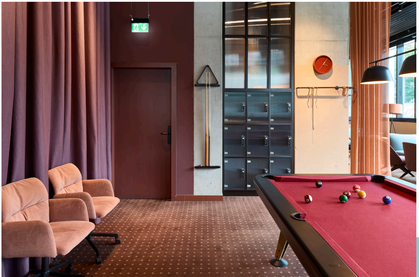
Tone on tone: the door and frame are kept in the same colour as the wall and thus become part of the wall surface.